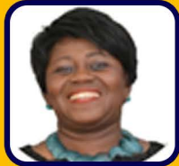
JUSTICE GERTRUDE TORKORNOO Justice of the Court of Appeal